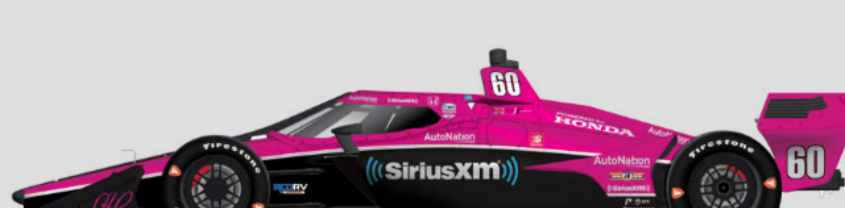
#60 JACK HARVEY