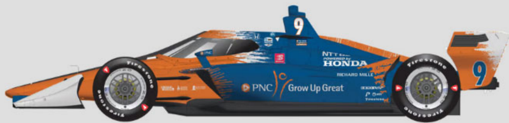
#9 SCOTT DIXON