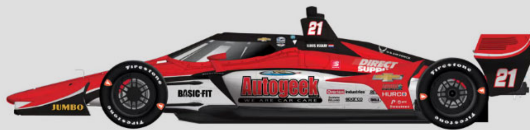
#21 RINUS VEEKAY