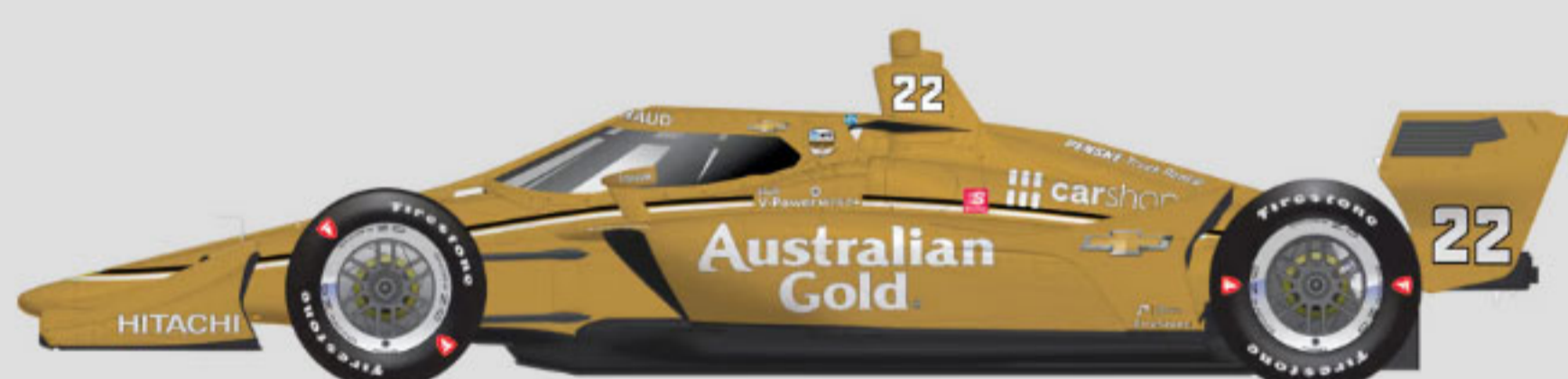
#22 SIMON PAGENAUD