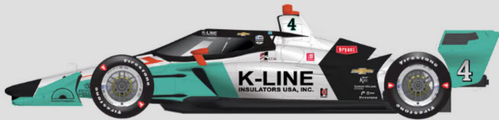
#4 DALTON KELLETT