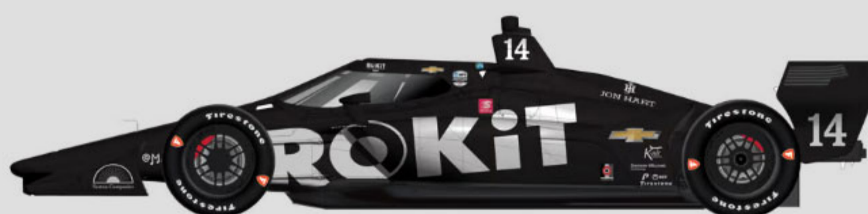
#14 SEBASTIEN BOURDAIS TAG HEUER