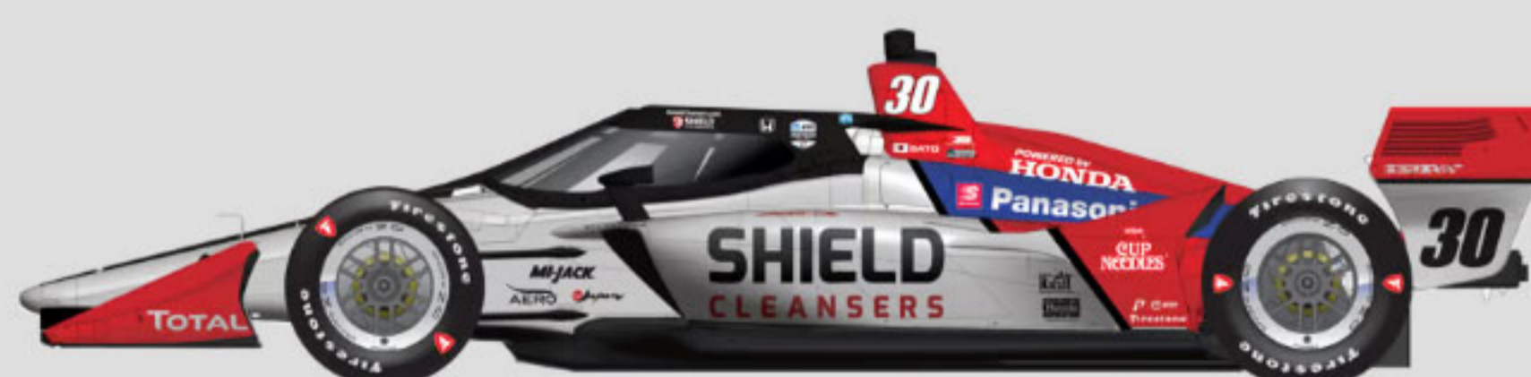
#30 TAKUMA SATO