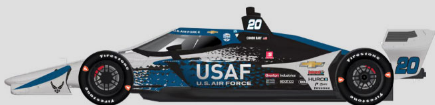
#20 CONOR DALY