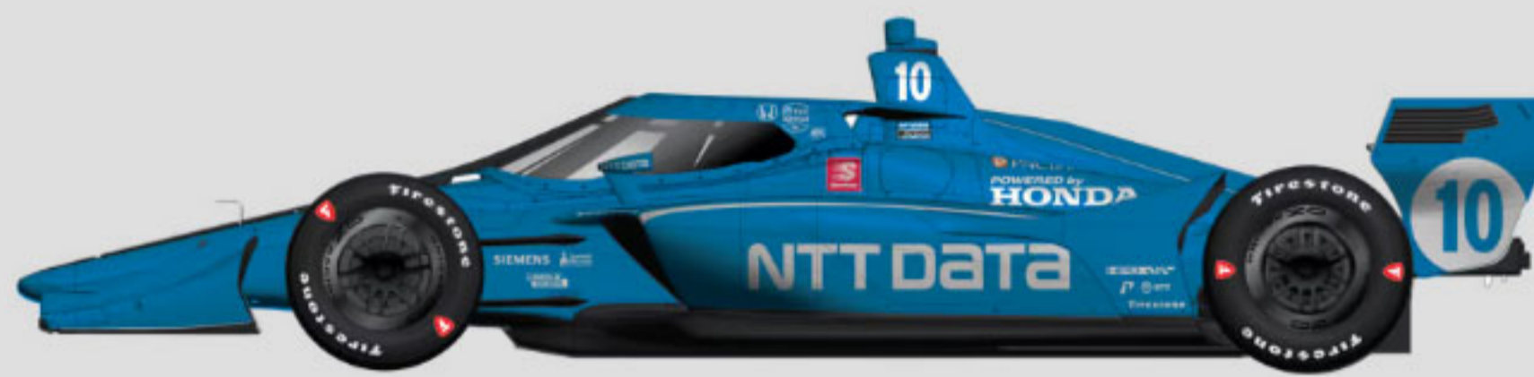
#10 ALEX PALOU