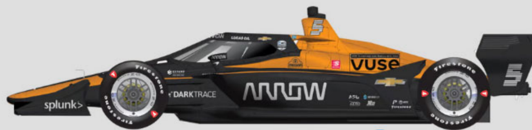
#5 PATO O'WARD R