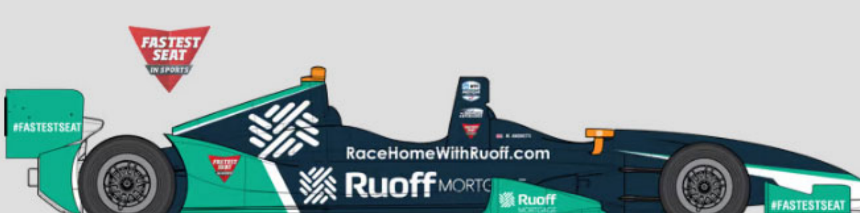
MARIO ANDRETTI FASTEST SEAT IN SPORTS TWO-SEATER