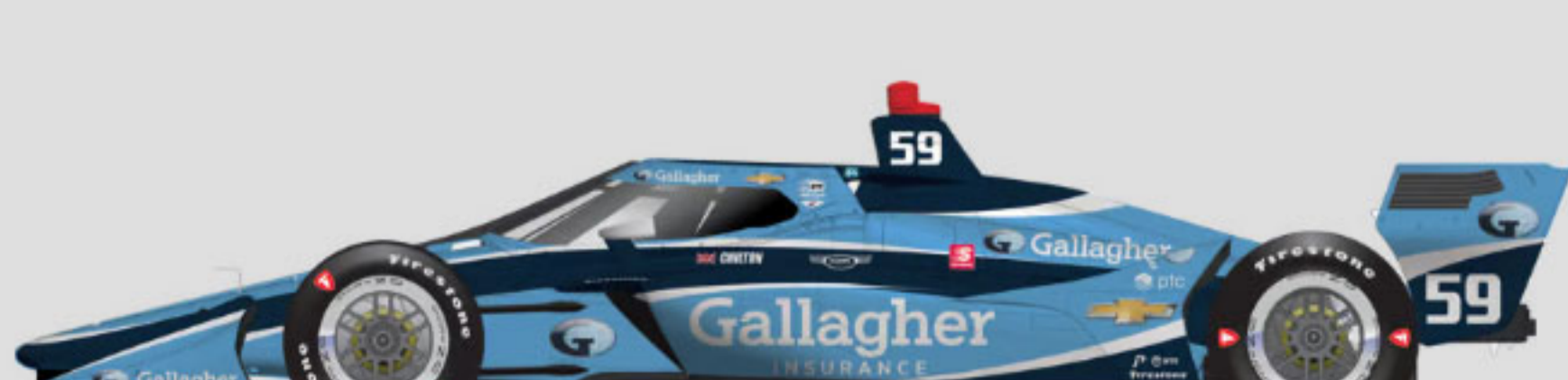
#59 MAX CHILTON