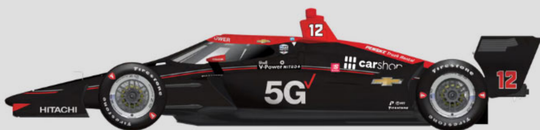
#12 WILL POWER F