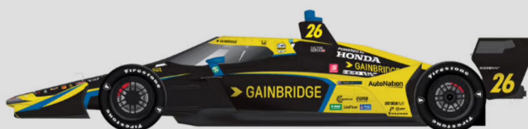
#26 COLTON HERTA