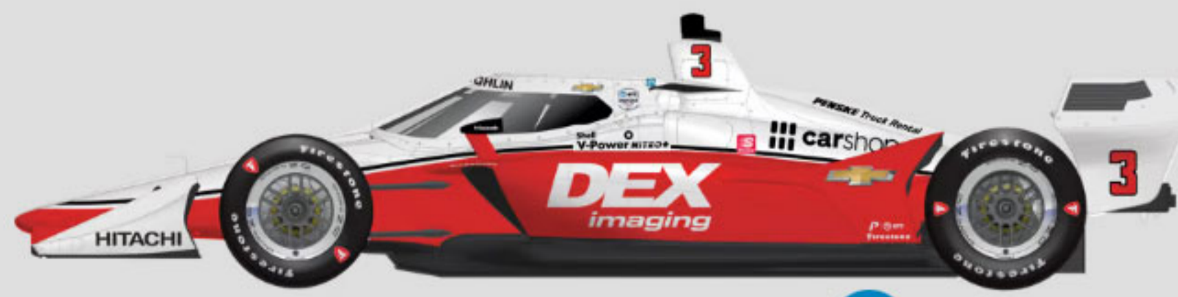
#3 SCOTT MCLAUGHLIN R