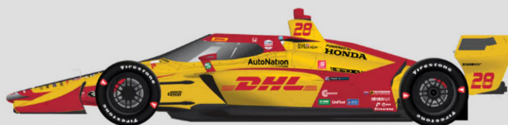
#28 RYAN HUNTER-REAY