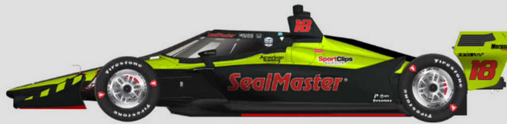
#18 ED JONES