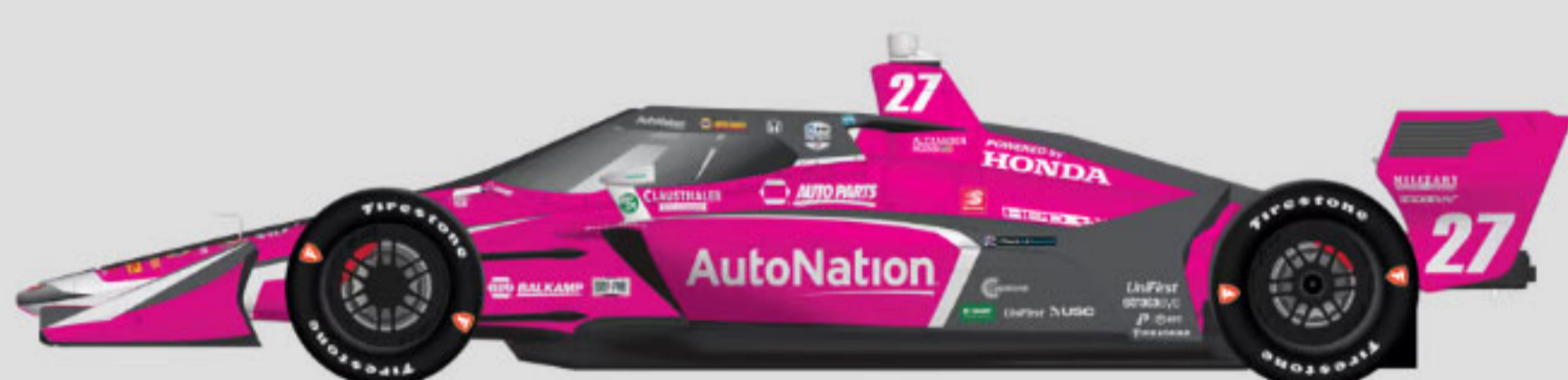
#27 ALEXANDER ROSSI