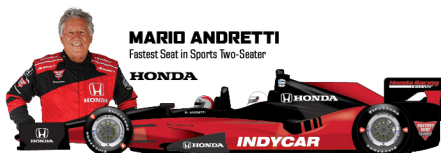
MARIO ANDRETTI Fastest Seat in Sports Two-Seater